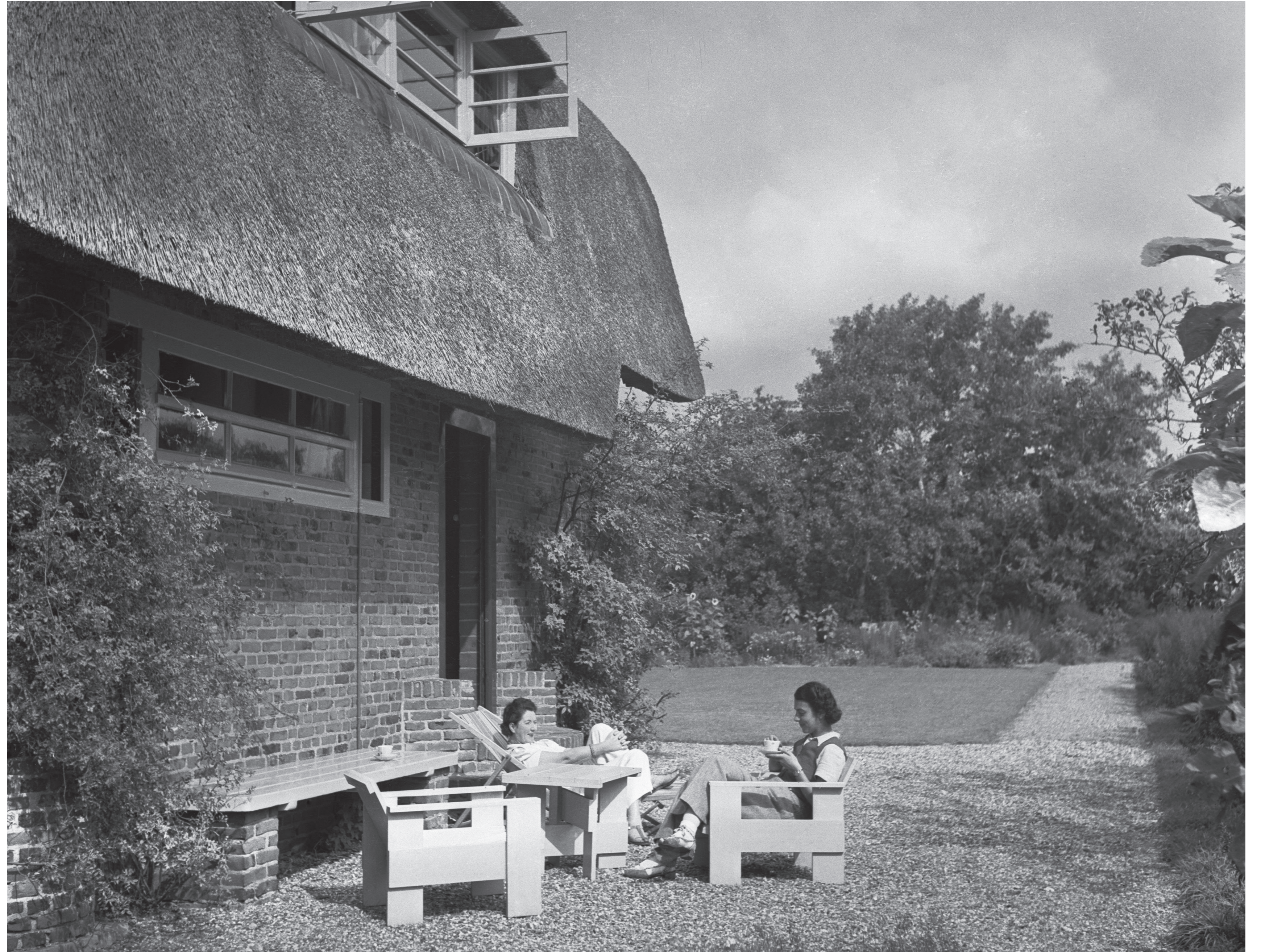
Charley Toorop and Eva Besnyö sitting on Crate Lounge Chairs in the garden of villa 'De Vlerken', Bergen, North Holland, 1933.