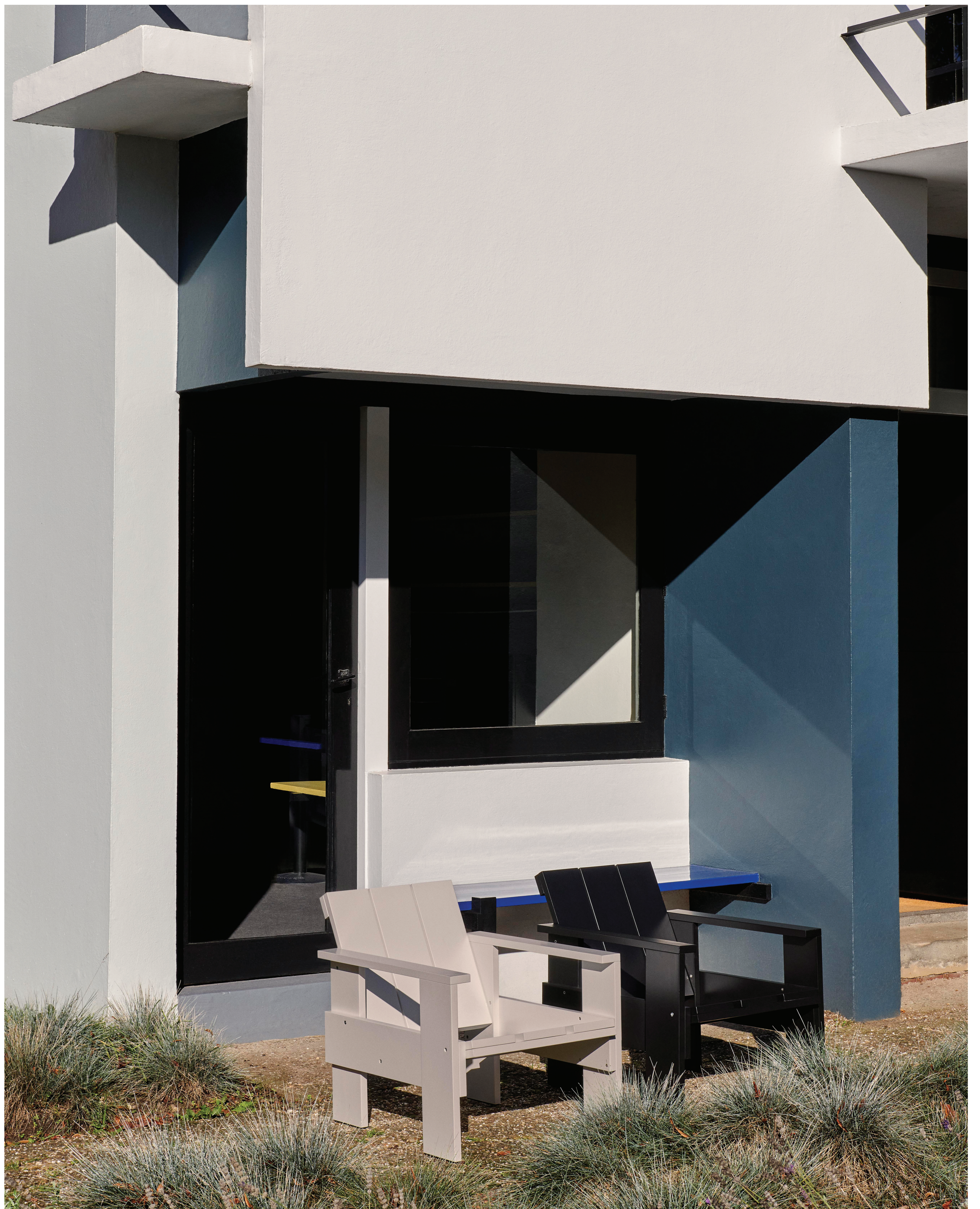
Crate Lounge Chairs in Schröder House by Gerrit Rietveld, Utrecht, Netherlands, 2022